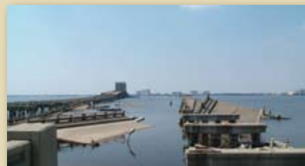
Hurricane Katrina damage to bridge

Redundancies in the transportation system, as well as the storm timing and track, helped keep the storm from having major or long-lasting impacts on national-level freight flows. For example, truck traffic was diverted from the collapsed bridge that carries highway I-10 over Lake Pontchartrain to highway I-12, which parallels I-10 well north of the Gulf Coast. The primary north-south highways that connect the Gulf Coast with major inland transportation hubs were not damaged and were open for nearly full commercial freight movement within days. The railroads were able to route some traffic not bound directly for New Orleans through Memphis and other Midwest rail hubs. While a disaster of historic proportions, the effects of Hurricane Katrina could have been even worse if not for the redundancy and resilience of the transportation network in the area.