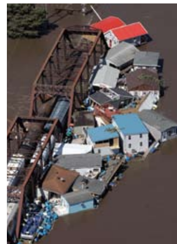
Buildings and debris float up against a railroad bridge on the Cedar River during record flooding in June 2008, in Cedar Rapids, Iowa.

The strategic examination of national, regional, state, and local networks is an important step toward understanding the risks posed by climate change. A range of adaptation responses can be employed to reduce risks through redesign or relocation of infrastructure, increased redundancy of critical services, and operational improvements. Adapting to climate change is an evolutionary process. Through adoption of longer planning horizons, risk management, and adaptive responses, vulnerable transportation infrastructure can be made more resilient. 215