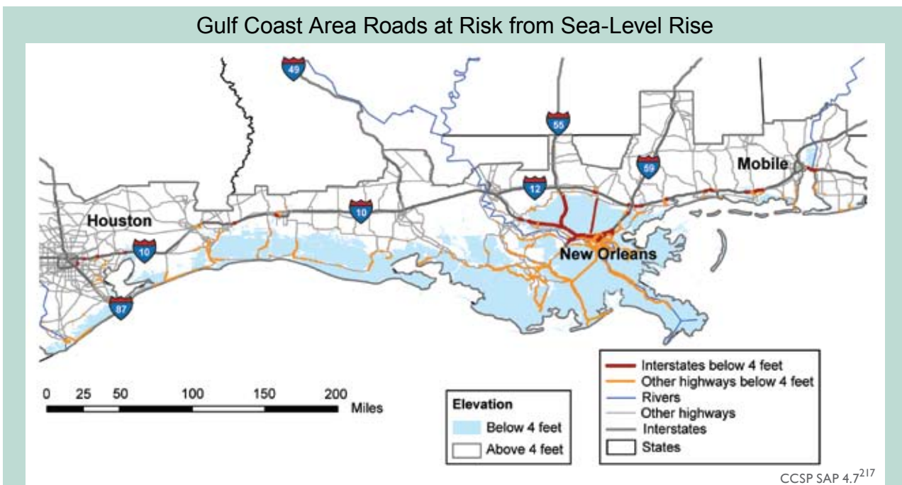
Within 50 to 100 years, 2,400 miles of major roadway are projected to be inundated by sea-level rise in the Gulf Coast region. The map shows roadways at risk in the event of a sea-level rise of about 4 feet, within the range of projections for this region in this century under medium- and high-emissions scenarios. 91 In total, 24 percent of interstate highway miles and 28 percent of secondary road miles in the Gulf Coast region are at elevations below 4 feet. 217