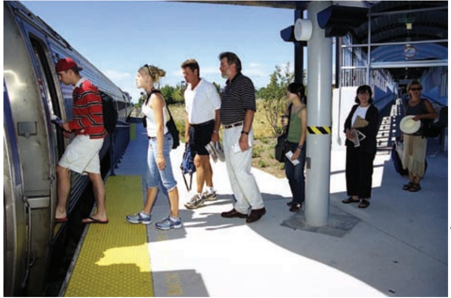
New England Futures/Maine DOT

Electric power. As a participant in the Regional Greenhouse Gas Initiative, Maine can reap substantial energy cost savings, promote economic development, and reduce emissions by auctioning 100 percent of the emissions credits created under the initiative and investing the proceeds in energy efficiency and renewable energy development. Governor Baldacci's Task Force on Wind Power Development can help Maine capitalize on its wind resources (largest among New England states) by